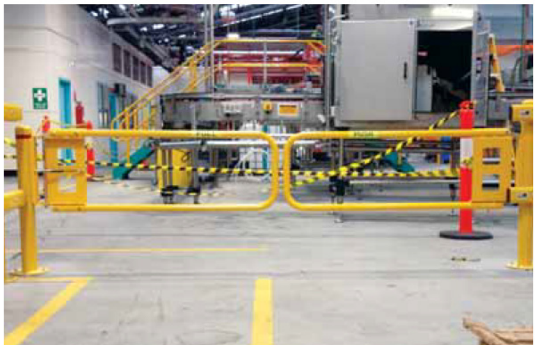
Double powder coated gate (BFGP) shown.