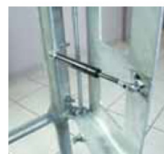
Gas strut closure.