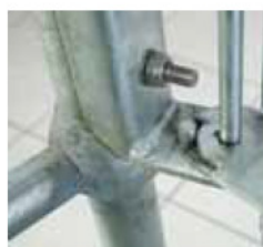
Built-in gate stop.