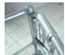
Adjustable hoop length.