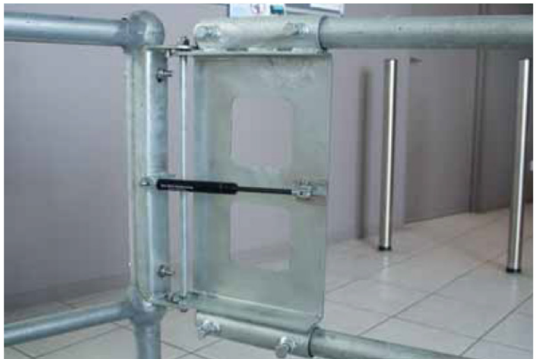
Gas strut provides gentle self-closing action.