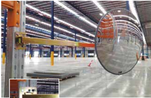
For use with polycarbonate mirrors.

There often situations where wall mount mirrors need an extended stand-off mount to clear obstacles or see around doorways or corners etc. This telescopic extension arm allows the mirror to be mounted to walls or columns and adjusted from 400 to 600mm of stand-off. Alternatively due to the design of the base plate it can be bolted to most types of pallet racking without the need to drill holes, thereby not compromising the structural integrity of the racking.