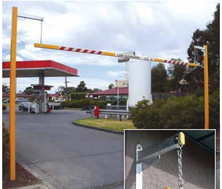
Height bar with optional Stand off brackets.