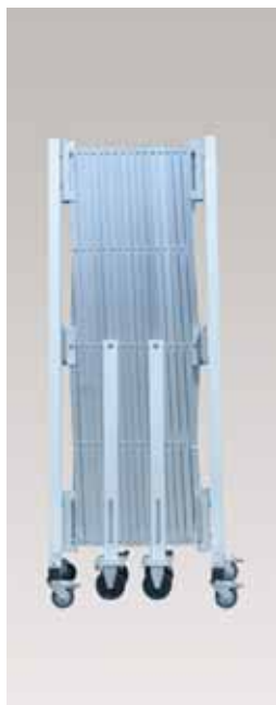
CLOSED: Port-a-guard Maxi.