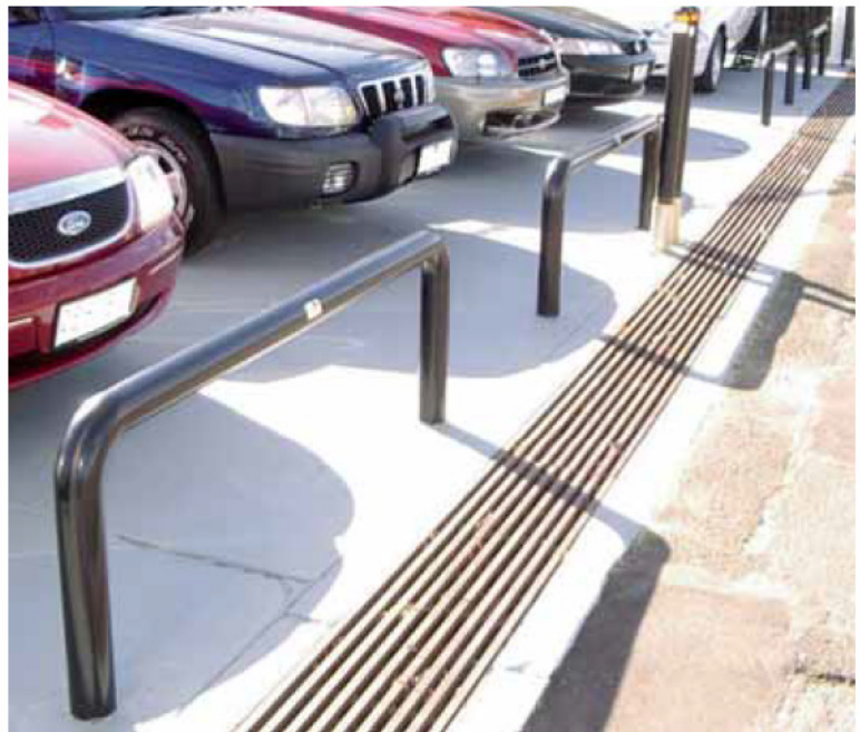
SURFACE MOUNT MODEL (Front view)