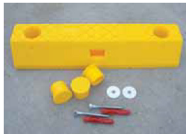
Menni body module.