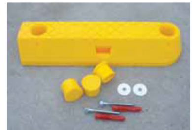
Menni end module.