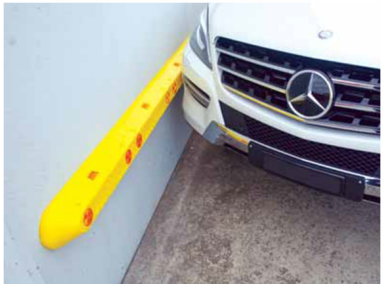
Menni vehicle bumper (shown here with optional reflector caps).